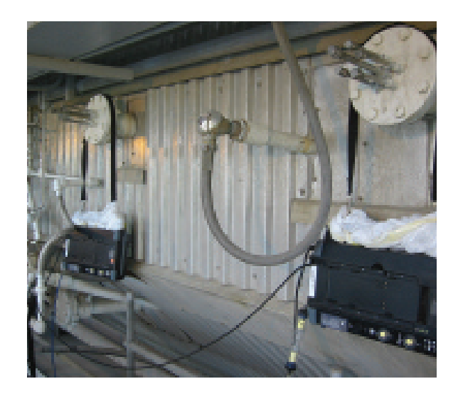
Ideal for: SCR optimizing, determining catalyst efficiency and performing overall trend analysis.