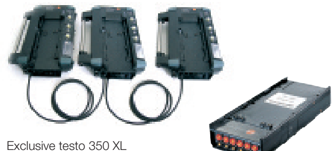
data bus system (max 16)

Understand your process inside and out with multiple 350 XL analyzer boxes. Real time, user defined measurements are displayed individually from each analyzer or simultaneously as a graph or table in our software package. Six channel analog output boxes can be looped in the bus system to provide a user scaled 4-20mA output.